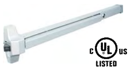
Rim-Type Exit Device