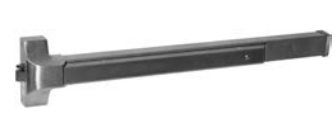
Grade 1 Rim-Type Exit Device