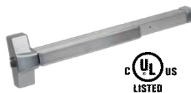
Rugged Grade 1 Rim-Type Exit Device