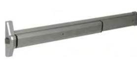
Modern Flat Rim-Type Exit Device