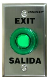
Illuminated Mushroom-Cap RTE Plates