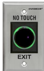
Illuminated No-Touch RTE Sensors