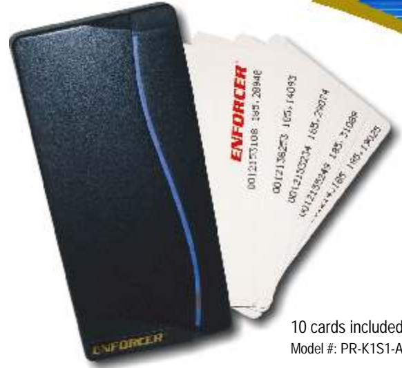
10 cards included Model #: PR-K1S1-A

The ENFORCER Stand-Alone Proximity Reader provides a flexible solution for controlled access. The stylish case and small size make it ideal for use in offices, homes and apartments. The wave-shaped tri-color LED status bar accents the case design. Simple installation, quick programming, and high reliability are combined in the PR-112S-A Stand-Alone Proximity Reader.