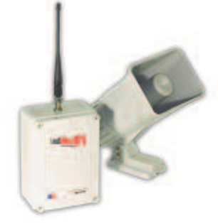
LoudMouth Wireless PA System