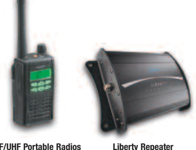
VHF/UHF Portable Radios Liberty Repeater 2 Watt & 5 Watt Models