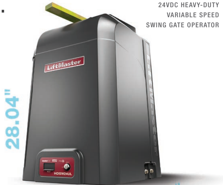
CAPACITIES STANDARD ARM