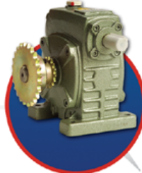
Heavy Duty Gearbox Efficient & Quiet