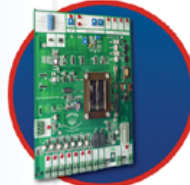
Control Board Easy to Use & State-of-the-art Advanced Features Come Standard Built-in Lightning & Surge Protection