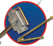
Quick-Release Swing Arm Simple & Secure No-Pinch Design for Added Safety No Welding Needed