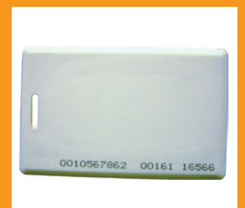
CARX-20 Accessory Access Card