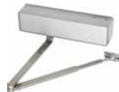
- Or - Hydraulic Closer