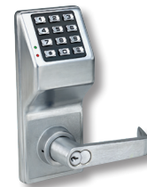
With IC Core in 26D DL2700IC/26D