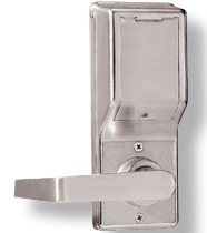
Secure battery compartment on inside door