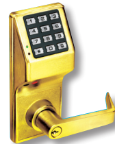
Lever set in US3 DL2700/3