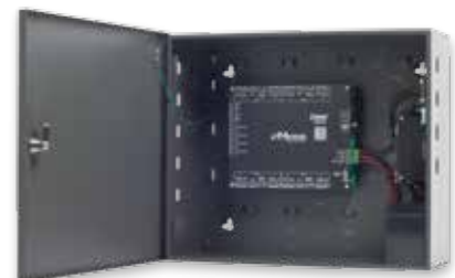
eMerge Essential Plus™

The comprehensive wizard is fast and intuitive, saving significant set-up time. Both the Essential and Essential Plus can be seamlessly scaled up, via software keys, to other eMerge E3-Series systems providing increased door and reader capacity, enhanced features, and higher level capabilities. The eMerge E3-Series makes expansion easy.